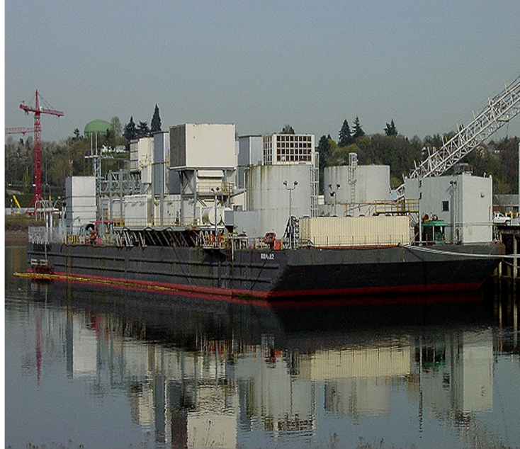
100MW P&W GTG Power Barge Sold by PPOL to a Gold Mining company in Ghana, Africa $12.5 million.